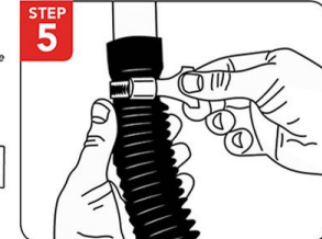
STEP 5 CONNECT TO DRAIN AND TIGHTEN CLAMP SimpleDrain® fits 1.5" or 1.25" tailpipes.