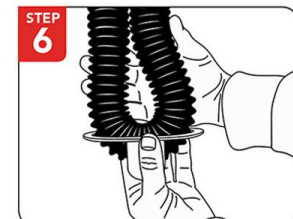
STEP 6 CONNECT TRAP LOOP Pinch hose and insert loop across valley of each side of the hose. Line up the loop with the bottom of the waste line and use the depth gauge on the loop to create trap. Check for leaks and tighten connections as needed.