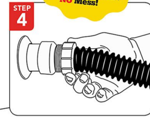
STEP 4 THREAD TO WASTE Fits standard 1.5" male threaded connection.