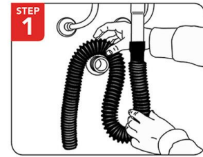
STEP 1 MEASURE THE HOSE LENGTH Add three convolutions before trimming.