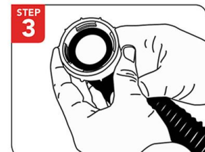
STEP 3 CONNECT FITTING Pull one convolution through fitting.