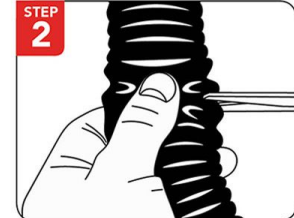
STEP 2 TRIM HOSE Only trim in valley of hose.