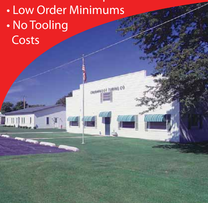
Crushproof factory in McComb, OH